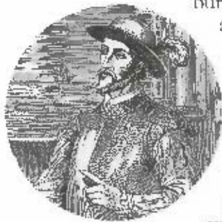
Ponce de León

burden. His colonization attempt quickly failed because of attacks by native people. Ponce de León's activities served, however, to identify Florida as a desirable place for explorers, missionaries, and treasure seekers.